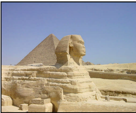
Sphinx & Great Pyramid